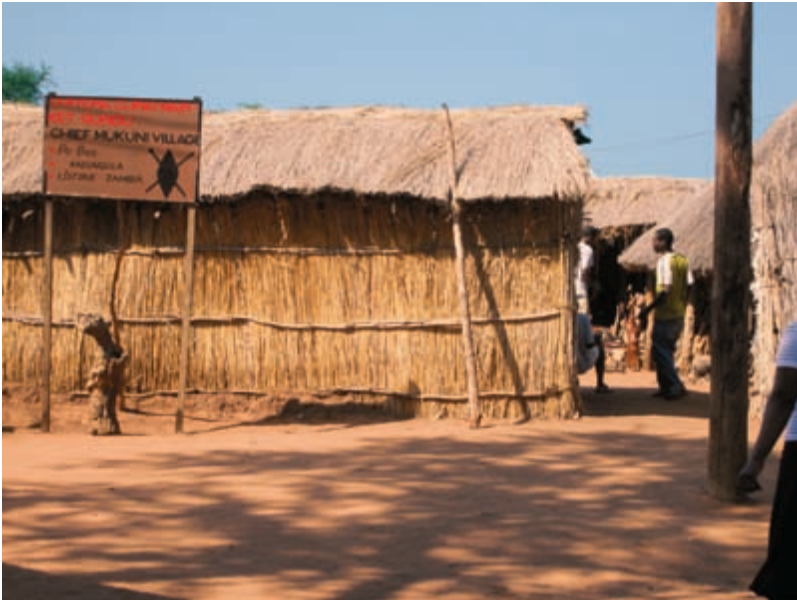
4 Chiyema Curio Market, Gundu. Chief Mukuni Village, near Livingstone, Zambia.