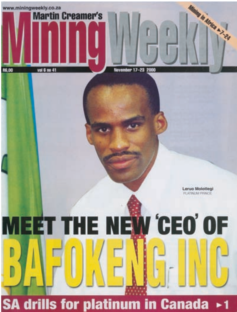
2 "Platinum Prince: Meet the New 'CEO' of Bafokeng Inc.," Creamer Media's Mining Weekly, 2000.