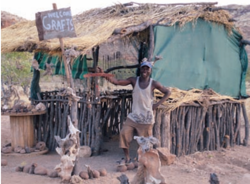
11b "Wellcome Grafts." Blaauwkrans, Damaraland, Namibia.