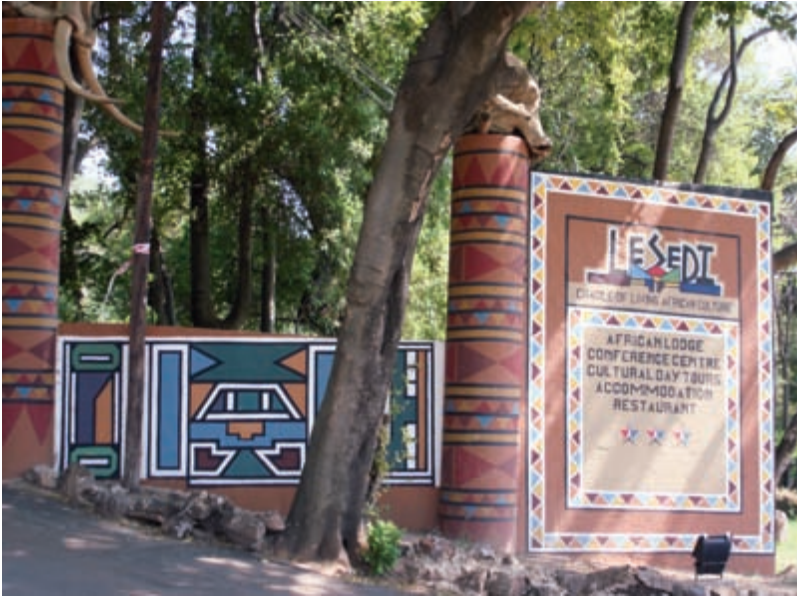
3 “Lesedi: Cradle of African Living Culture,” near Hartebeespoort, North West Province, South Africa.