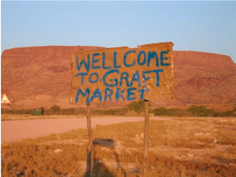
11a "Wellcome to Graft Market." Blaauwkrans, Damaraland, Namibia.