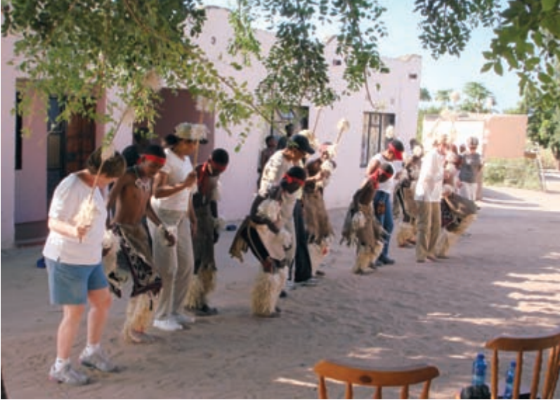
5c Mafunya Cultural Village, Limpopo, South Africa: (iii) learning the dance: American tourists performing their otherness.