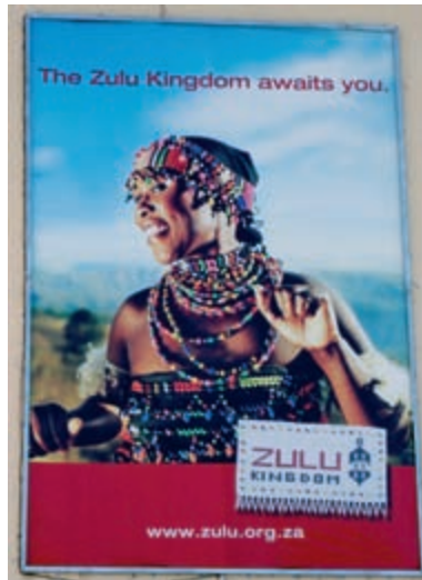
6 "The Zulu Kingdom Awaits You: www.Zulu.org.za ." Roeland and Canterbury Streets, Cape Town, November 2006.