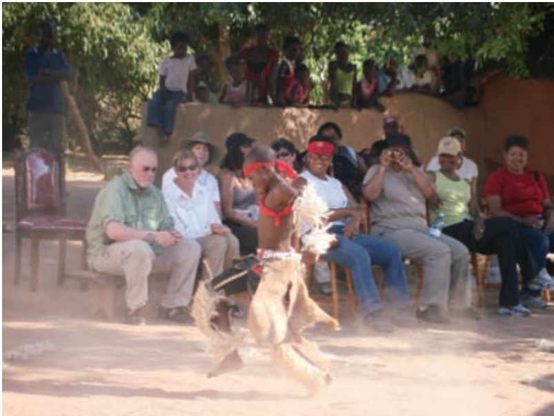
5b Mafunya Cultural Village, Limpopo, South Africa: (ii) enacting "culture": children of Mafunya and American tourists watching a young dancer in faux traditional costume.