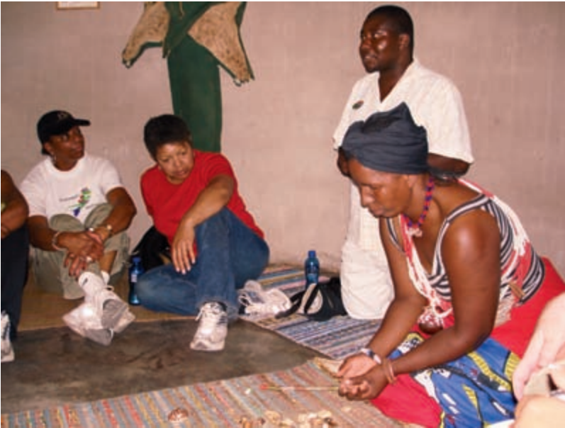
5d Mafunya Cultural Village, Limpopo, South Africa: (iv) "traditional" healer, in translation, performs a divination for African-American tourists, September 2007.