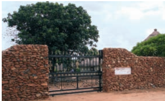
7 Makuleke Cultural Village, Limpopo, South Africa.