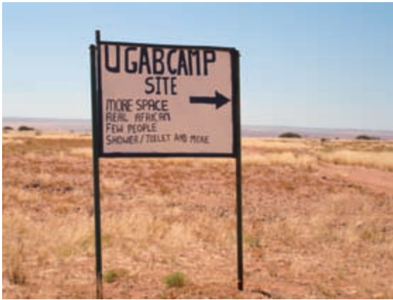
9 "More Space, Real African." Central Namibia, 2007.