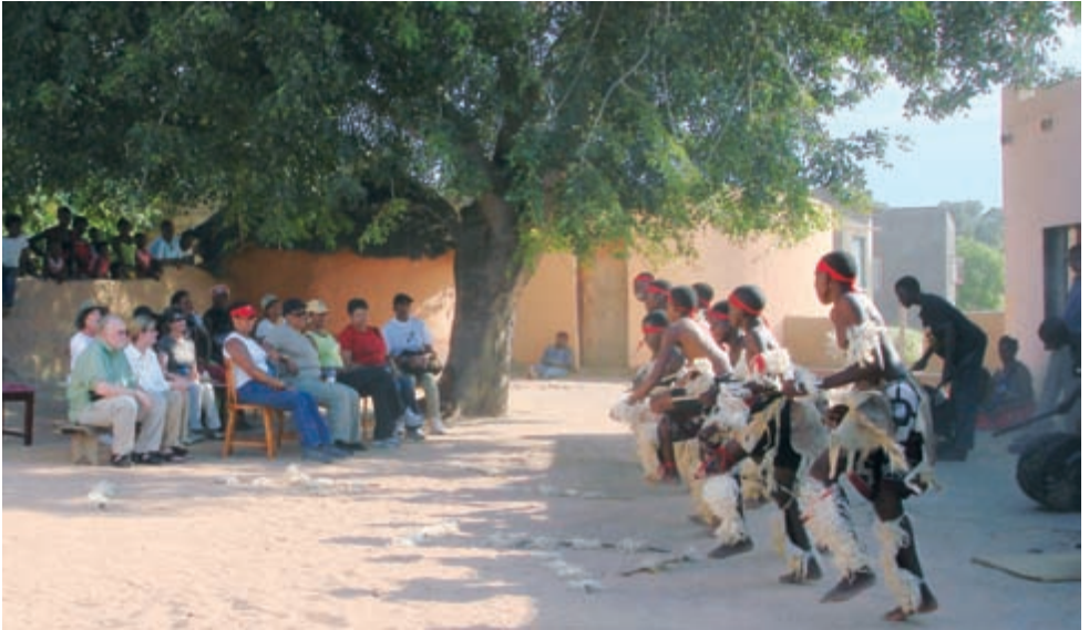
5a Mafunya Cultural Village, Limpopo, South Africa: (i) enacting "culture": children of Mafunya and American tourists watching a group trained to perform "traditional" dances.