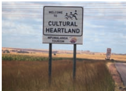
8 "Welcome to Cultural Heartland: Mpumalanga Tourism." Mpumalanga Province, South Africa.