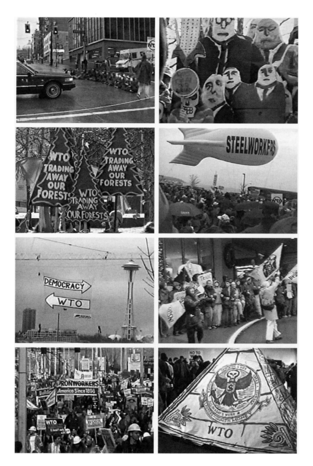
Mouffe | "Every Form of Art Has a Political Dimension" 119