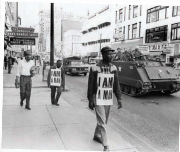
Memphis sanitation workers strike, 1968.

Cultural workers are variously striated by class-background, race, gender, age, immigration-status, education, institutional affiliation, and cultural prestige, with the most elite often serving as the avant-garde of gentrification. Building a strike-alliance involving cultural workers will thus be complicated. Matters of privilege and hierarchy will need to be deeply examined. But it will also be quite powerful, given