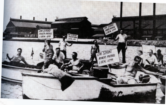
"On strike, River Patrol, Local 1299"

Would you strike for queer rights, the undocumented, the homeless youth, the women?