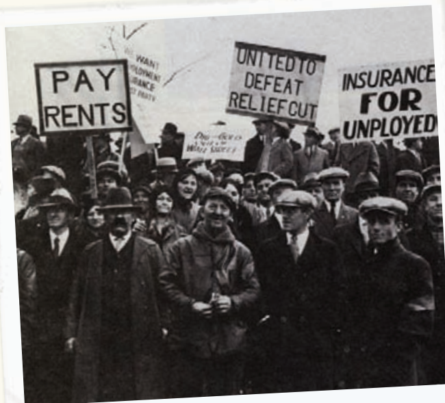
A hunger march organized by the unemployed councils, Chicago 1932.

“WE HAVE BEEN USED BY CAPITALISM, WE HAVE BEEN SOLD AND TRADED ON WALL STREET, WE HAVE BEEN EXPECTED TO CREATE HEALTHY HOMES AND FAMILIES AND ARE THEN EVICTED FROM THOSE SAME HOMES WITHOUT A SECOND THOUGHT.”