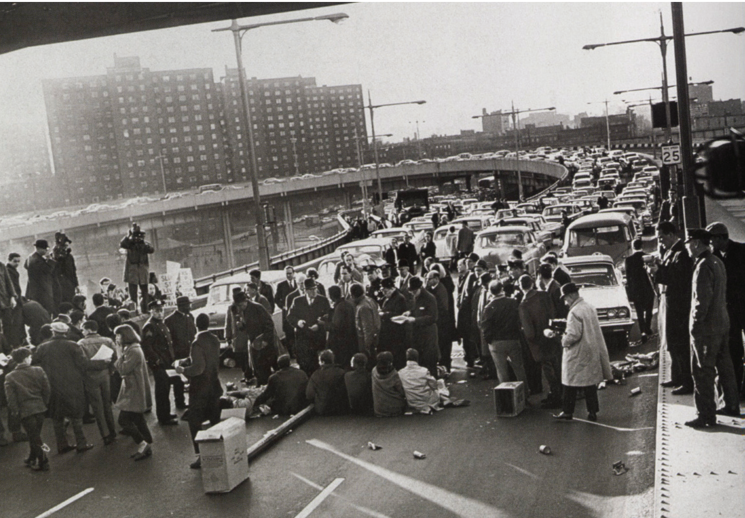
Blocking the triborough bridge during a 1964 sit-in protesting unequal living and school conditions of African-Americans.

mind that every manner of manipulation, false promise, lie, obfuscation, pressure or cajolery was employed to extract it; you're too insignificant to back out of your word.