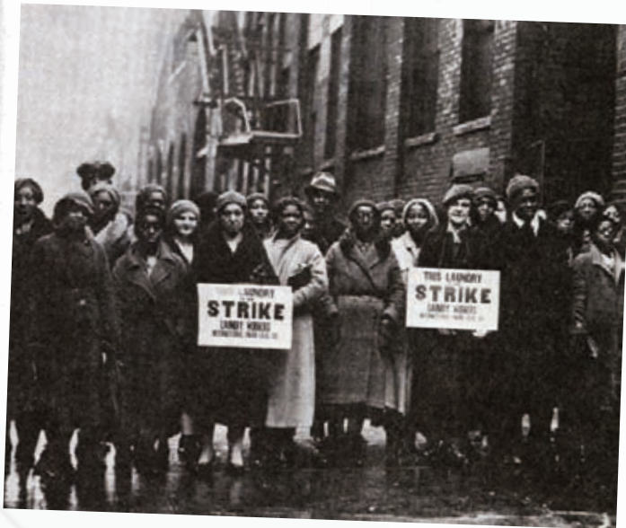
Laundry Strike, NYC

Who strikes? Who has the right to strike?