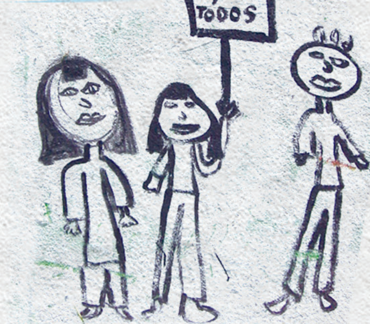
Graffiti from Argentina

Years later, many reflect on the question of elections and the State in a different way. The perspective is not a total boycott. The most important thing, however, is to maintain the movements' agendas and—from the point of reference of the movement—decide strategically the relationship to institutional power. Some have referred to this strategy as "With, Against and Beyond the State." Along these lines, at the time of the latest elections, one movement participant explained that her perspective was to "vote and run." She explained that there were intentionally few conversations in the assemblies about the current elections.